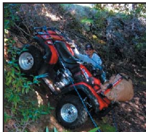
Larry Carr's ATV getting hauled up the hill it rolled down.