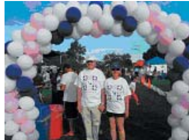
The balloon arch marked each lap.