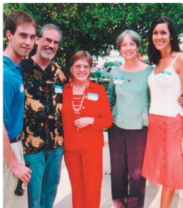
The McGinty Clan