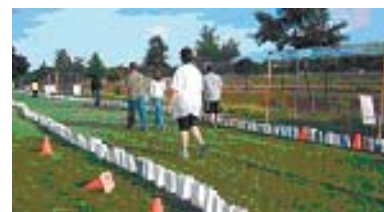
Relayers pass by luminarias, sacks filled with sand and a candle, and lighted later in the evening.