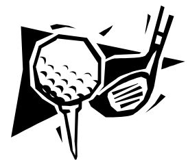
Golf Tournament Meeting immediately following regular meeting of 4/10